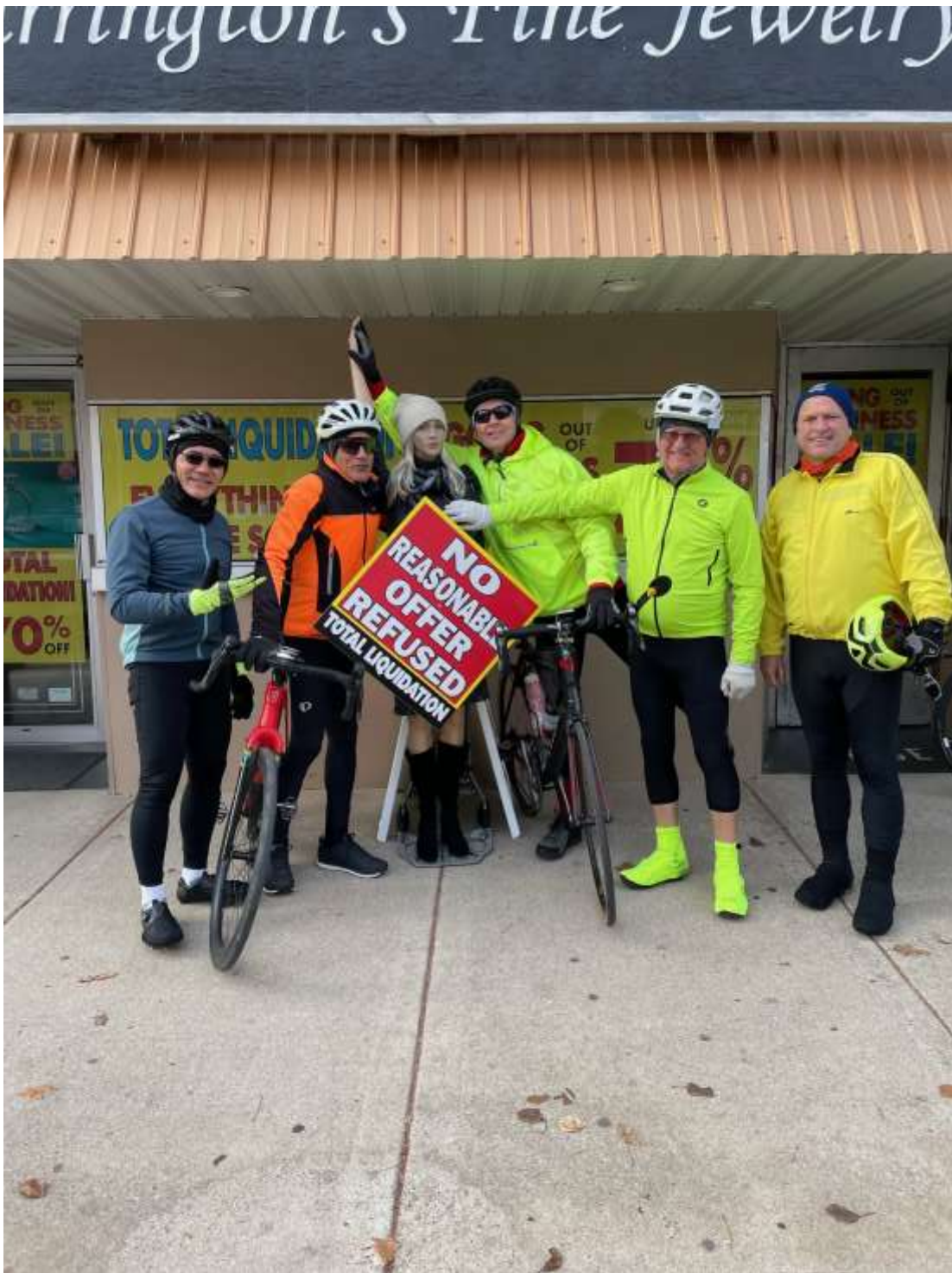
"I don't think that is what she was offering Conrad!"