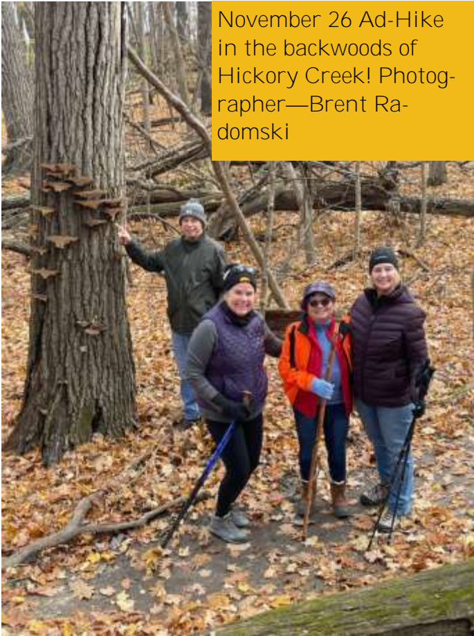
November 26 Ad-Hike in the backwoods of Hickory Creek!