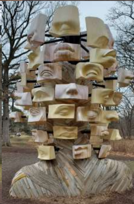
Ad Hike—December 25, 2022 — Morton Arboretum