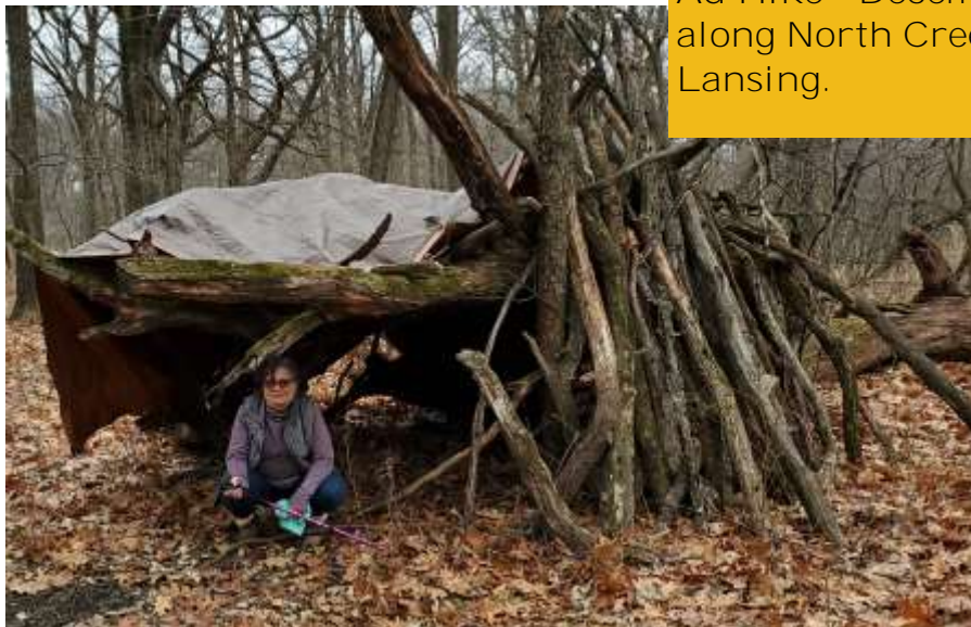
Ad-Hike—December 24 along North Creek near Lansing.